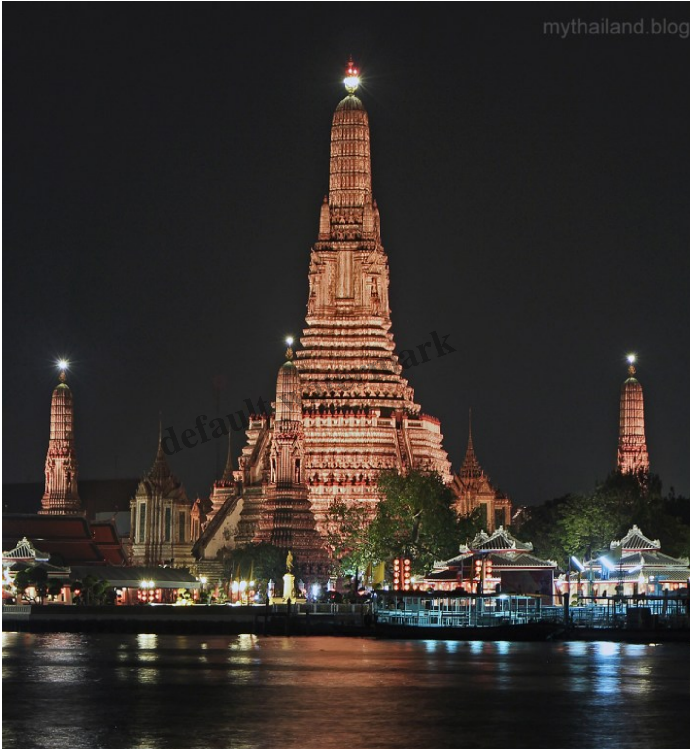
Wat Arun. Temple of Dawn